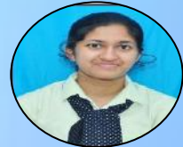
Alrea Patrao II PCMC

The workshop was very informative and gave an insight into how important it was for students of science stream to have a back up plan along with aiming for an admission in top and reputed colleges. The session provided us information about the various branches of engineering and medicine along with courses such as law, national defence, civil service which are open for all the students. The resource person emphasised on the various opportunities that are now being availed by science students other than medical and engineering. He also discussed about the various competitive exams that a science student can answer. The resource person also guided the students to identify their interests and aims for a brighter future rather than following the general trend or being a victim of peer pressure or parental pressure. The session aimed at making the students aware of the multiple career options available and the importance of having an out of the box thinking.