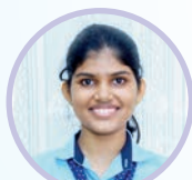
AVVAMMA AMRA 568/600