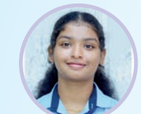
P S SINCY 577/600