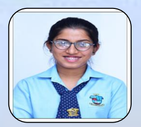
Deanne II SEBA 'A'